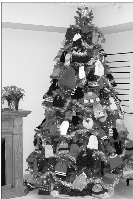
United Electric Cooperative Inc. employees and members collect winter apparel to give to local children on a Mitten Tree in the Heyburn, Idaho, office.

Coos-Curry Electric Cooperative, Port Orford, Oregon. Employees helped a shelter for battered and abused women and children, at AARP income tax filing events, an animal shelter and boat races.